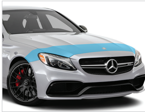
Partial Hood and Fender

Clear gloss polyurethane for stone chip protection, high wear, and abrasion in the automotive, motorcycle, RV, powersports, bicycle, aircraft, and other transportation markets.